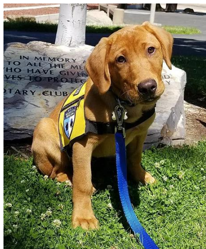
Oscar as a young puppy

I will always remember Oscar. He helped me heal my heart. More importantly, he reminded me that I can still make a difference.