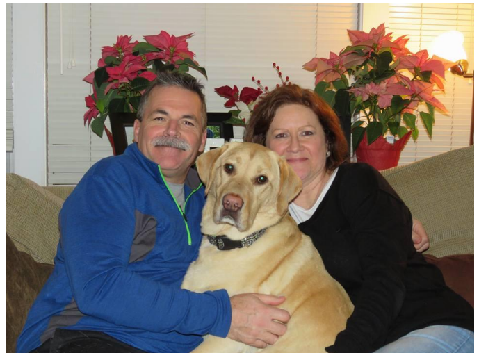
Both released Brigadoon Dogs

"Acquiring a dog may be the only time a person gets to choose a relative." —Mordecai Siegal